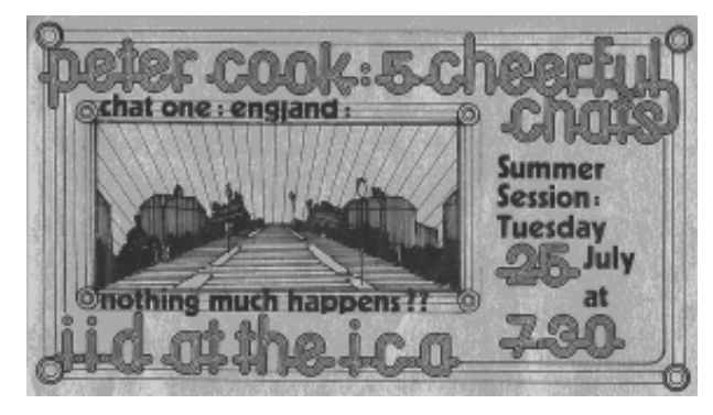
Fig. 4: The International Institute of Design Summer Session 1970, publicity stamps.

Fig. 3: The International Institute of Design Summer Session, publicity flyer for Peter Cook's "5 Cheerful Chats".